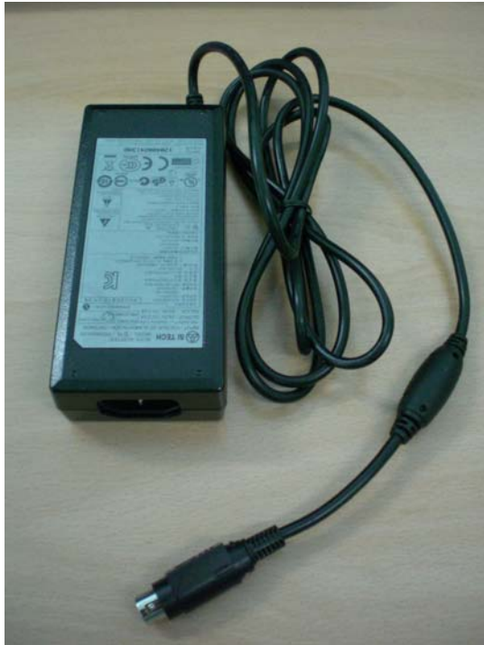
3pin type power brick

2. You can see two types of power brick as the image belows.