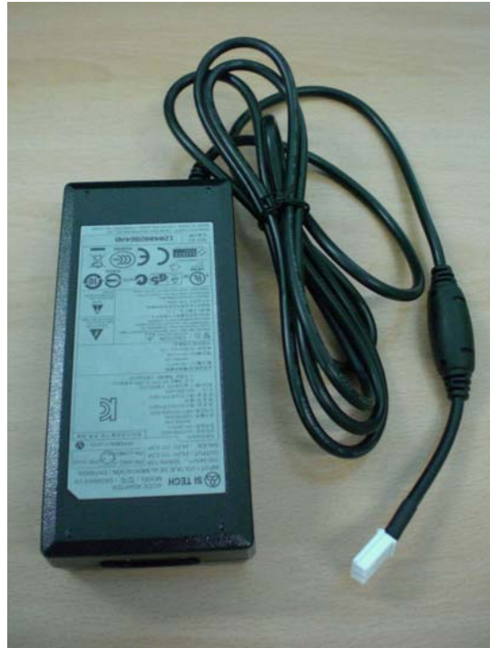
2pin type power brick