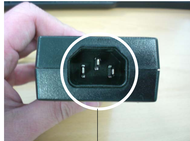
It is to connect with the power cable.